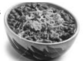
The Boulevard Chili Cook-Off Saturday, July 10