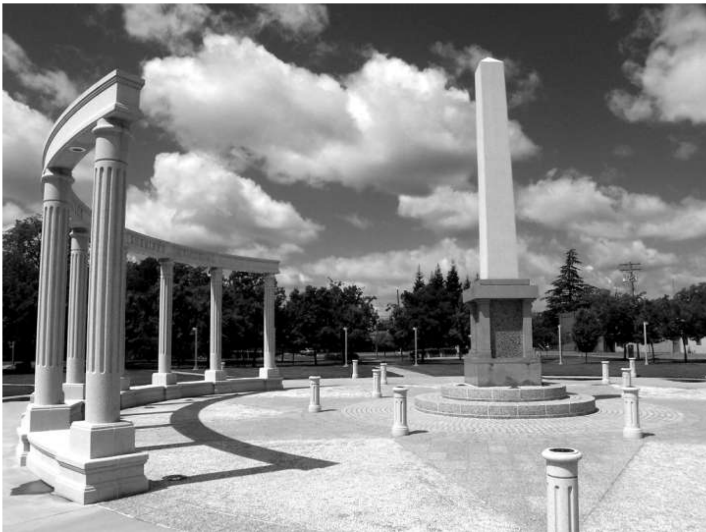
2010 Memorial Ceremony