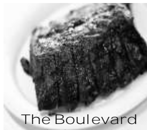
The Boulevard Rib Cook-Off Saturday, June 12